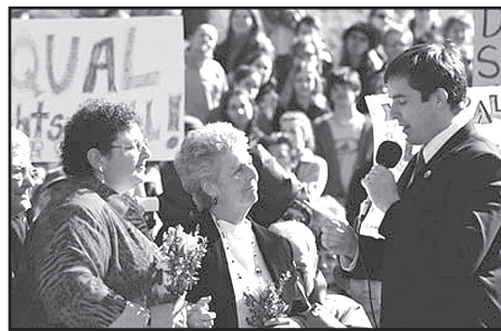
Green New Paltz, NY mayor Jason West solemnizing same-sex marriages in 2005.

The Green Party won't retreat on privacy rights, women's reproductive rights, gay rights (including same-sex marriage), and other rights and freedoms because of pressure from religious extremists and corporations. Many Democrats have compromised on all these issues, and voted for repressive Republican legislation to limit people's rights.